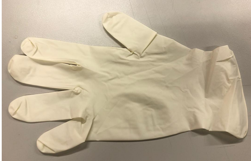
Photo: Latex powder free online chlorination glove (013143633), Size M